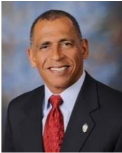
District 1 Mayor Brian Tisdale Elected 2022