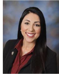
District 4 Councilmember Natasha Johnson Elected 2024