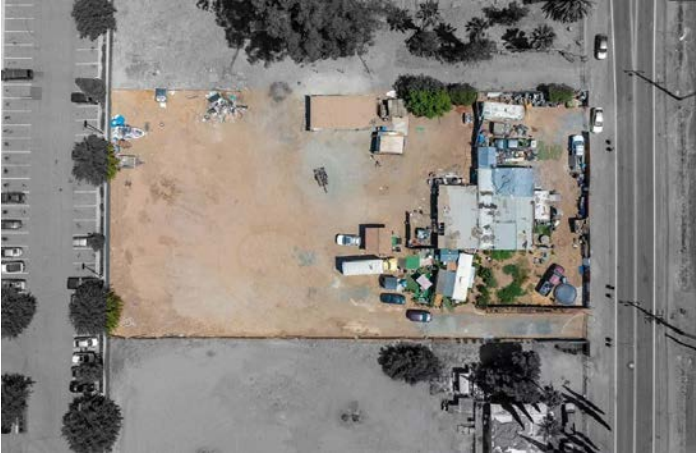
Lake Elsinore lot